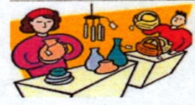
Venders Yard Sale

PUBLIC: Free admittance. Get out, enjoy Fall, & see folks!