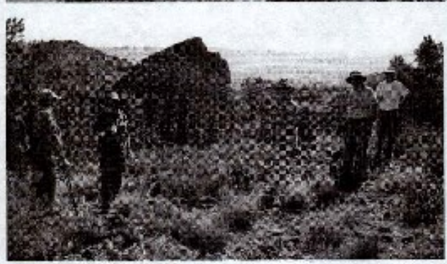
Meadview Community Church News