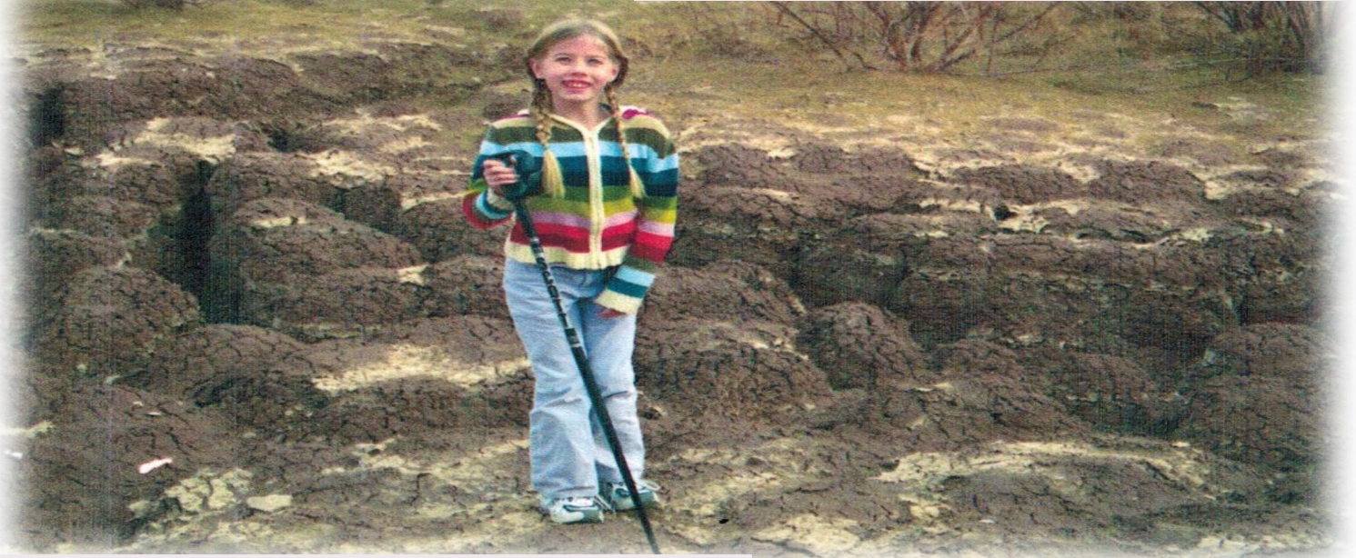
2006 > The mudflats left when the water vanished from Pierce Ferry